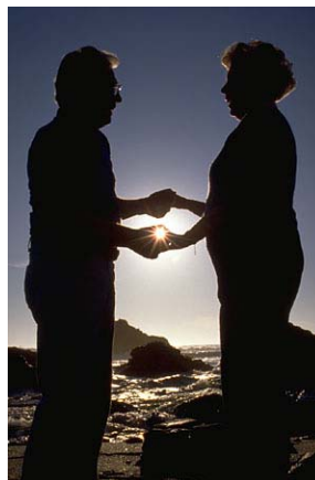
Sleep well every night

At first, you may experience some stiffness of your jaw when you wake up. It generally takes a few days until you become accustomed to wearing the appliance.