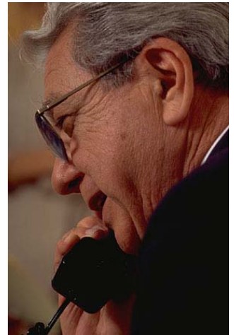
Imagine never having to avoid certain foods again