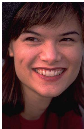
Implants are permanently fixed, giving you complete confidence

At Gentle Dental, we have introduced a new type of implant, not generally available in the U.K. Traditionally implants have had to be left for up to six months to integrate, but this type of implant can usually be used in 10 days to two weeks.